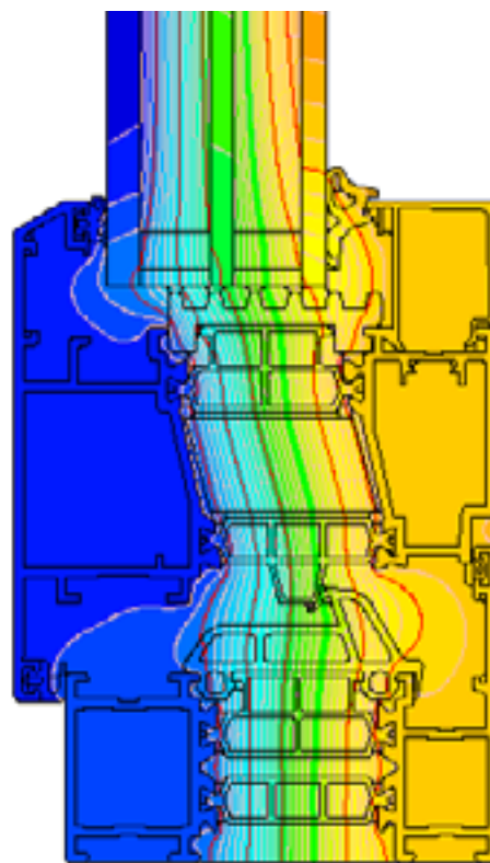
example isotherm arrangement for the assembly of the frame and window sash of the SP OUT i+ window system (SP010 + SP521)